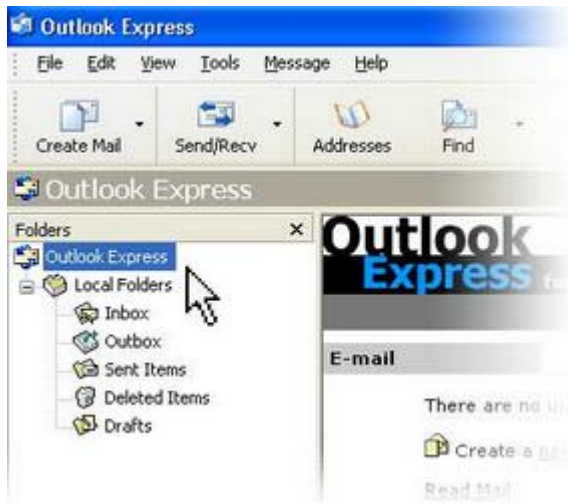
Outlook Express list of folders